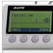
Large, Easy-to-Read LCD Display