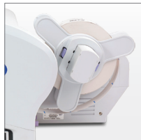
Large Media Supply