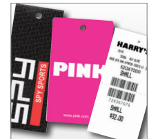
Great for Retail Tagging