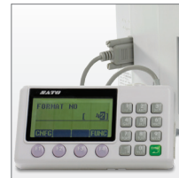
Optional Programmable Keyboard (Stand-alone Operation)