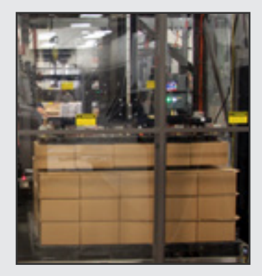
The process repeats until the load is completed, including adding a sheet to the top of the load.